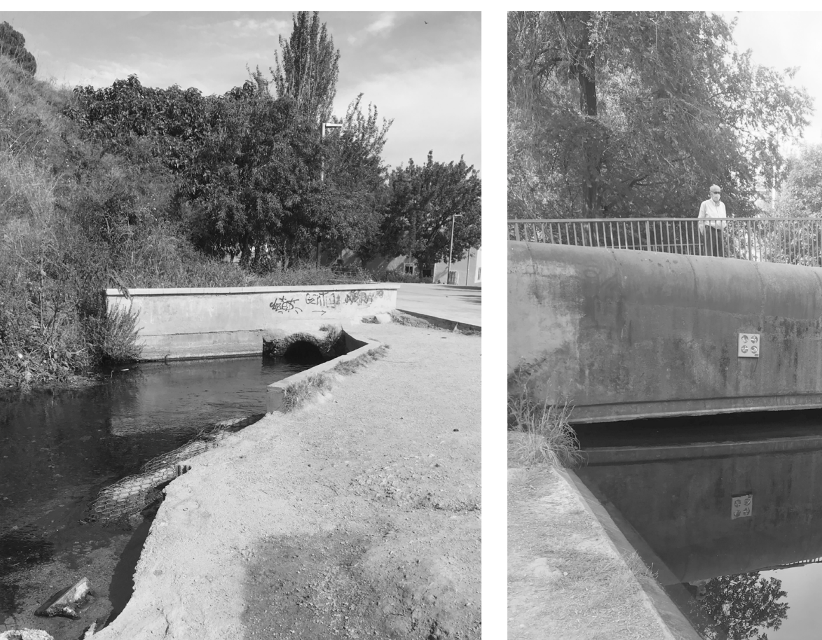
Previous state Plaça Primer de Maig

Rec Comtal has been one of the most important hydraulic infrastructures in Barcelona that supplied water and irrigated the Besos agricultural territory from the 10th century to the middle of the 20th century. Therefore, it is an essential element to understand the economic and social development of the last thousand years in Barcelona.